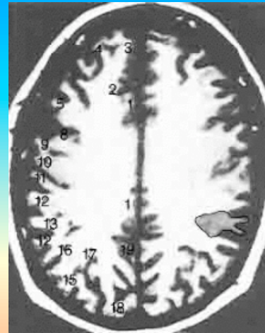
Stimulation of the thumb point in the ear with acupuncture